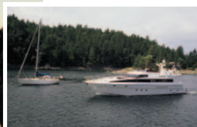
Photos from left to right: Merry Island lighthouse, Smuggler Cove Marine Park, Secret Cove