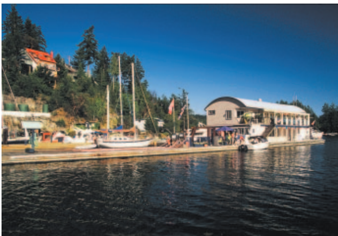
Secret Cove Marina

Be aware of the extent of Tattenham Ledge, especially on a flooding current, as the tide has a diagonal westerly set and boats big and small have inadvertently drifted onto the ledge with disastrous results. Anchor off the beach in depths of 5-10m where the holding is good in sand. The bay is open to the northwest but offers excellent shelter from south-easterly winds. Deep in Buccaneer Bay, off Gill Beach, good shelter, good holding and plenty of swinging room is available to survive the strongest of south-easterly winds. The nearby Surrey Islands and Water Bay also provide convenient shelter from southeast winds, should one suddenly spring up.