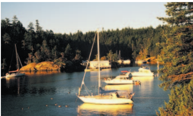
Smuggler Cove Marine Park