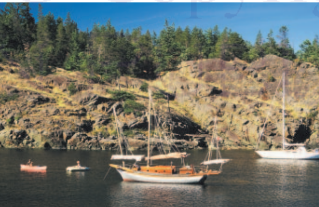
Simson Marine Park

Note: Secret Cove is a busy harbour. Leave channels to all marinas and fuel floats clear